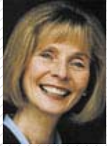
lois capps 23rd congressional district