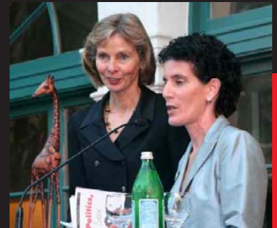
Rep. Capps accepts the "Giraffe Award"