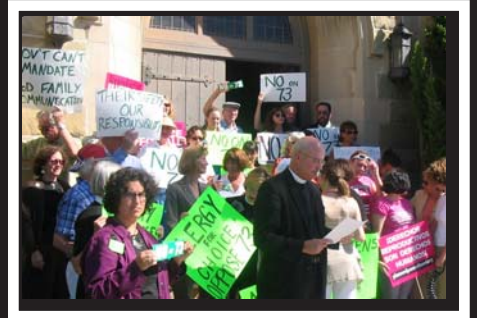
Clergy for Choice and Republicans for Choice co-sponsor Santa Barbara press conference